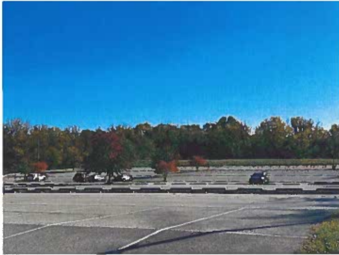
Figure 3: HCC Parking Lot O where volunteers will replant 11 microbioretention swales under the 2024 G3 Grant