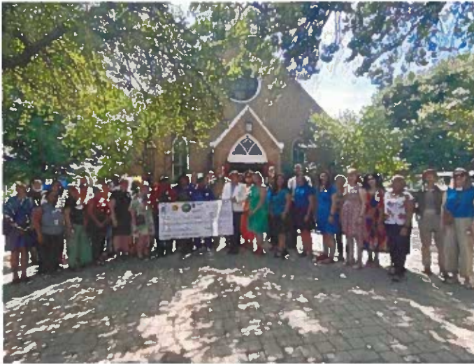
Figure 2: CBT Grant awardees group photo at Congressional Cemetery, Washington, D.C., June 2024